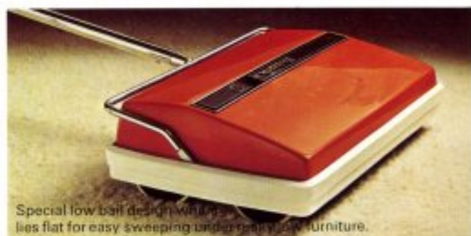
Special low bail design which lies flat for easy sweeping under most furniture.