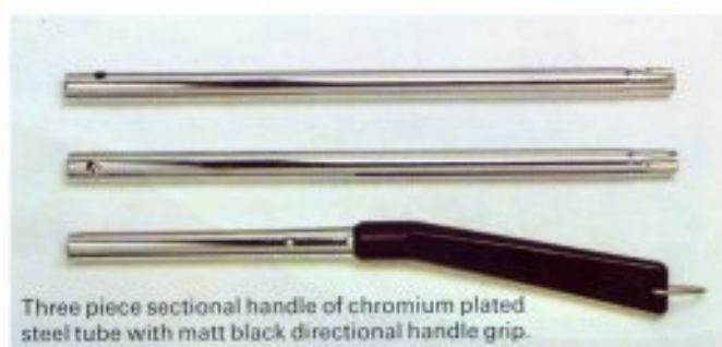
Three piece sectional handle of chromium plated steel tube with matt black directional handle grip.